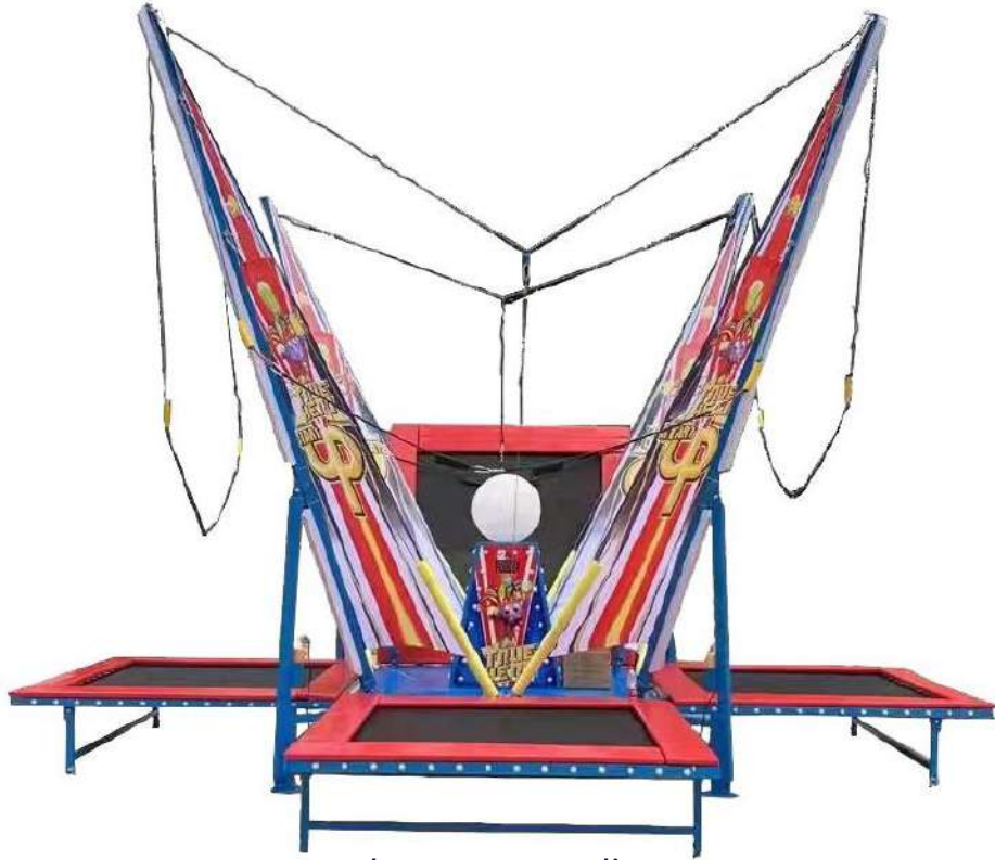
4 Players Trampoline