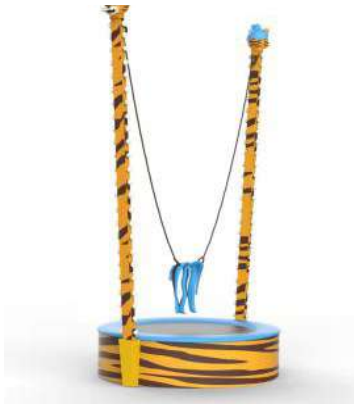
Single Player Trampoline