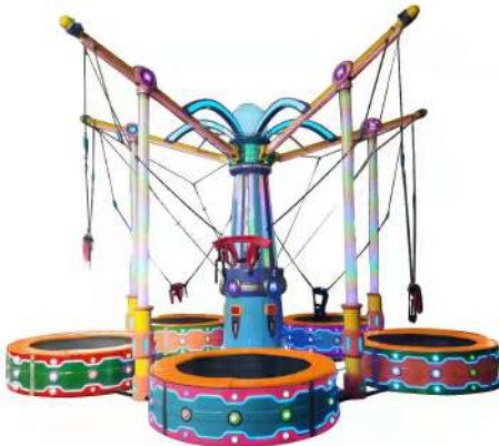
5 Players Trampoline