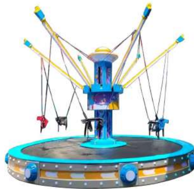
Multiple Players Trampoline